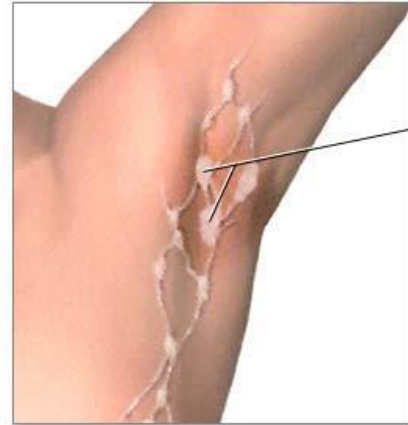
Armpit lumps caused by swollen lymph nodes