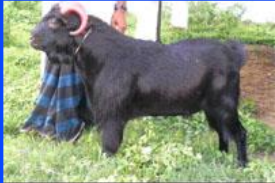
Black Bengal Buck Solid black