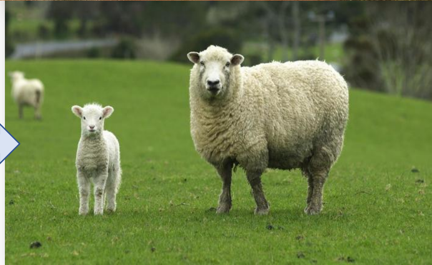
S H E E P