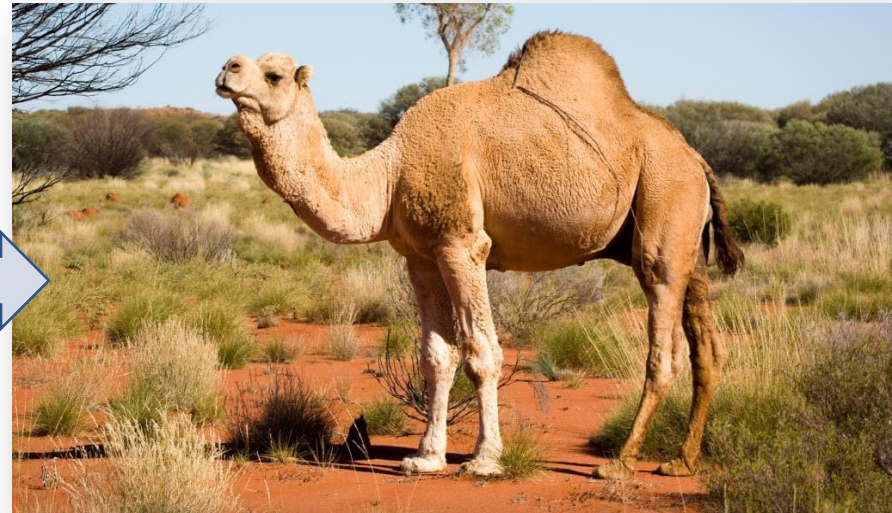
C A M E L