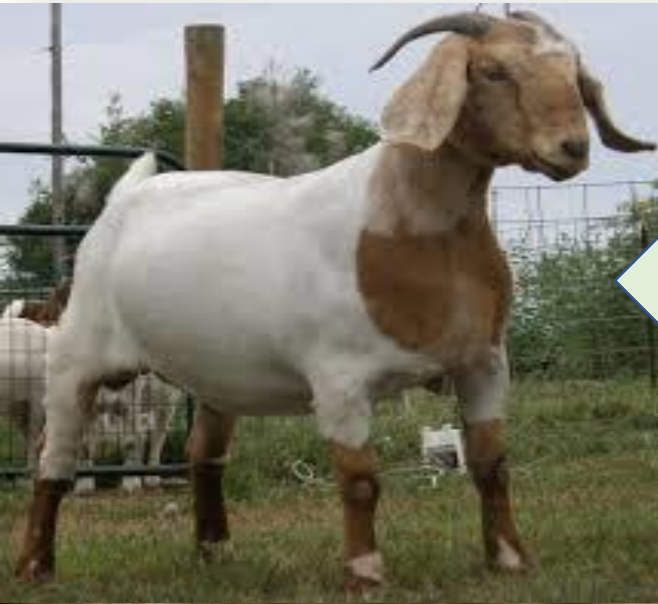
G O A T